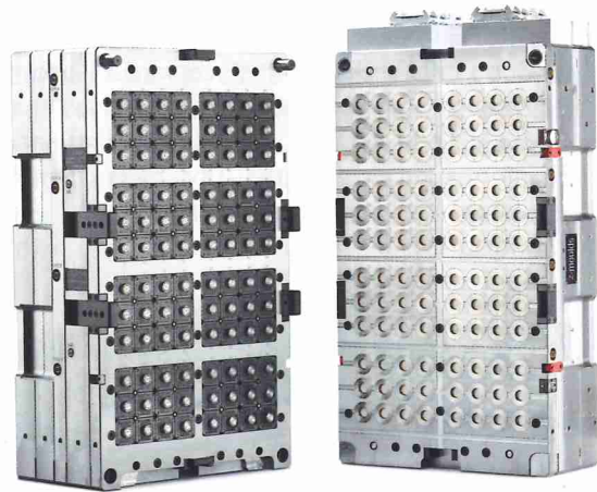
Z-MOULDS: 96 cavity mould